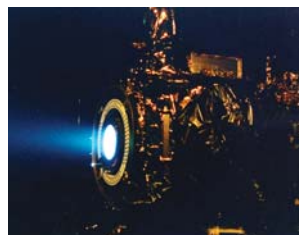
Xenon ion test firing at Jet Propulsion Laboratory.

While not nearly as powerful as rocket engines, the efficiency of ion engines used in spacecraft allows for continuous operation over long periods of time. Satellite ion engines function when electrical energy collected by solar panels excites or "ionizes" gas molecules to produce an impulsion plasma. Xenon is ideal for this application because it can be easily ionized, has low heat capacity and a high density. In addition, xenon's high molecular weight improves satellite specific impulse performance (the ratio of engine thrust over weight flow).