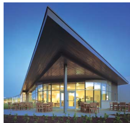
Air Liquide Delaware Research and Technical Center.