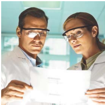
EPA Protocol Gas Preparation

Our exclusive GHG EPA protocol calibration standards help facilities comply with legislation governing greenhouse gas emissions. These four and five-component mixtures include methane and carbon dioxide, enabling you to monitor emissions more efficiently and economically by allowing you to monitor CO, CO 2 , CH 4 , NO 2 and SO 2 using a single calibration gas standard.