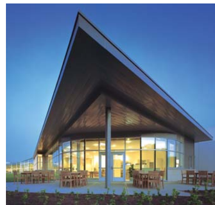
Air Liquide Delaware Research and Technical Center